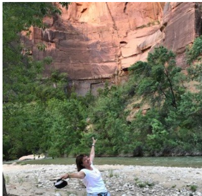
Hiking at Zion National Park 2017

I'm tired of the gym!! Tired of the same old classes and tired of the VERY LOUD MUSIC!! My ears actually hurt when I'm in some classes. So while I was watching the Olympics specifically ice skating, I remembered how much I love it! So I dug out my ice skates which I bought new 10 years ago and went skating!!! Mind you I was very nervous as my balance wasn't what it used to be. But I went and after an hour I was doing pretty good. (FEET WERE KILLING ME) NO twirls or fancy stuff but I did not fall!! So get out there and try some-thing you used to love to do!!